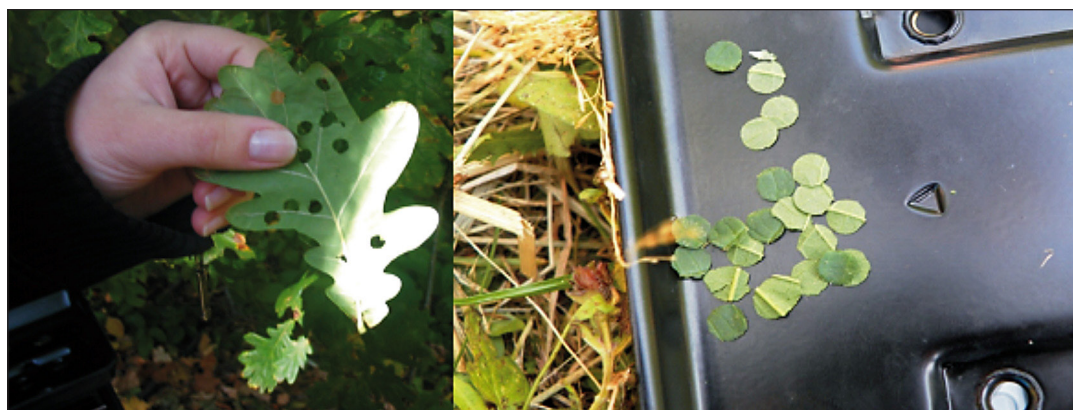
Fig. 1. Method of taking samples from leaves. Immediately after collecting the sample from the tree, circles of leave were taken. It should be done as fast as possible. If it is feasible, the circle should be taken without picking up leaves from a plan

After incubation the enzyme activity was terminated by the addition of 1% sulphanilamide in 8% HCl. The concentration of synthesized nitrite in the incubation buffer was determined colorimetrically upon diazotization and the formation of azo dye following the addition to the reaction mixture of 0.02% N-(1-naphthyl)