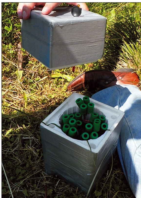
Fig. 3. Temperature in incubation chamber is stable, it is filled with water and allow for fast adjust of temperature. The temperature is set and adjust to constant level for all incubation time using ice cubes or warm water

ethylenediamine dihydrochloride [3, 4]. Optical density was measured colorimetrically after 10 min. at 540 nm using a spectrometer (Shimadzu UV-120). A mixture of incubation buffer with 1% sulphanilamide in 8% HCl and 0.02% N-(1-naphthyl)ethylenediamine dihydrochloride in the same proportion as used in creating the