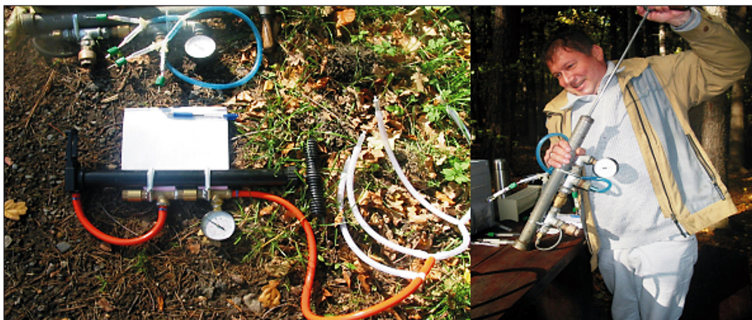
Fig. 2. After sampling the leaf rings were placed in test tubes and exposed to low pressure treatment (0.33 atm.). The manual low pressure system is constructed with two valves, vacuumeter and pump with converted piston